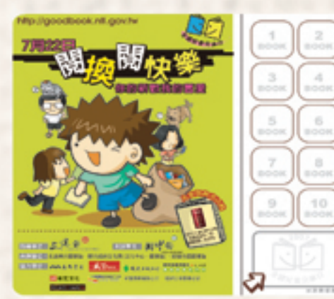
Book Exchange Card (2007)