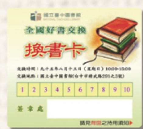
Book Exchange Card (2006)

In order to popularize the habit of reading and encourage residents in Taiwan to share and reuse book resources, the National Taichung Library (NTL) integrated the Book Exchange Activity once held locally by public libraries at different time and places into a big festival called National Book Exchange Day that takes place simultaneously in public libraries nation-wide.